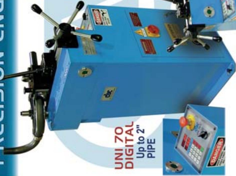
UNI 70 DIGITAL Up to 2" PIPE