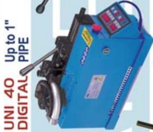
UNI 40 DIGITAL Up to 1" PIPE