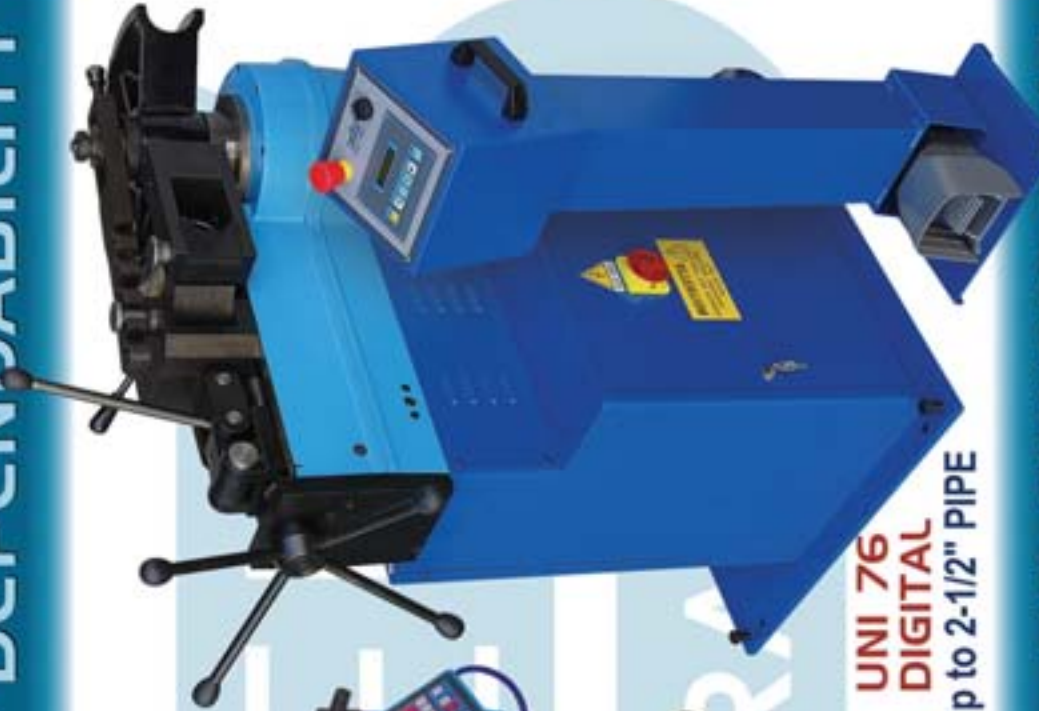
UNI 76 DIGITAL Up to 2-1/2" PIPE

P. O. Box 850 Stapleton, AL 36578 www.carellcorp.com sales@carellcorp.com