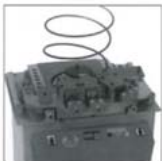
SPIRAL HOOP DEVICE OPTIONAL