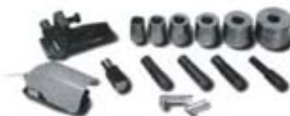
TYPICAL ACCESSORIES PINS, ROLLERS, FOOT PEDAL