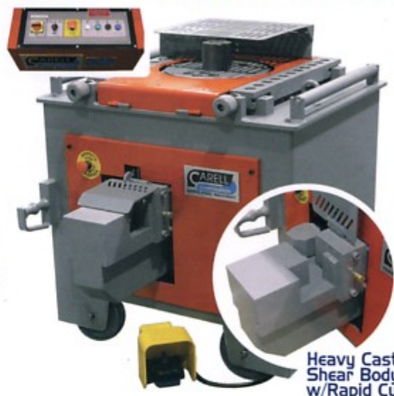
Heavy Cast Shear Body w/Rapid Cycle