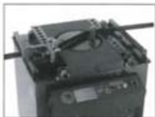
LEFT/RIGHT STANDARD Produce Double Bends and bend from Left or Right