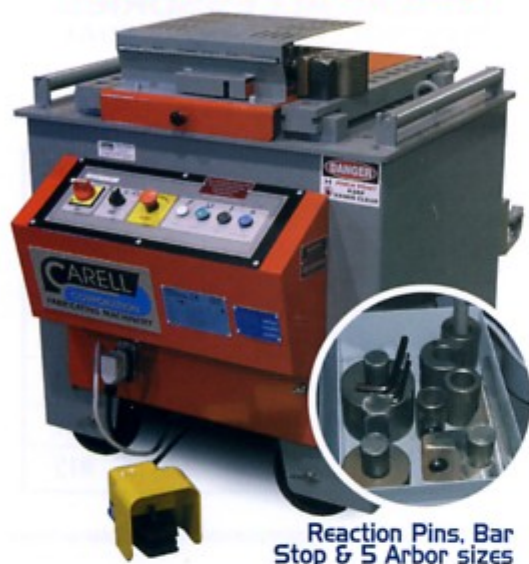
Reaction Pins, Bar Stop & 5 Arbor sizes