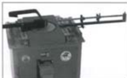
STIRRUP ACCESSORIES Optional, stirrup bending tool & adjustable length stop